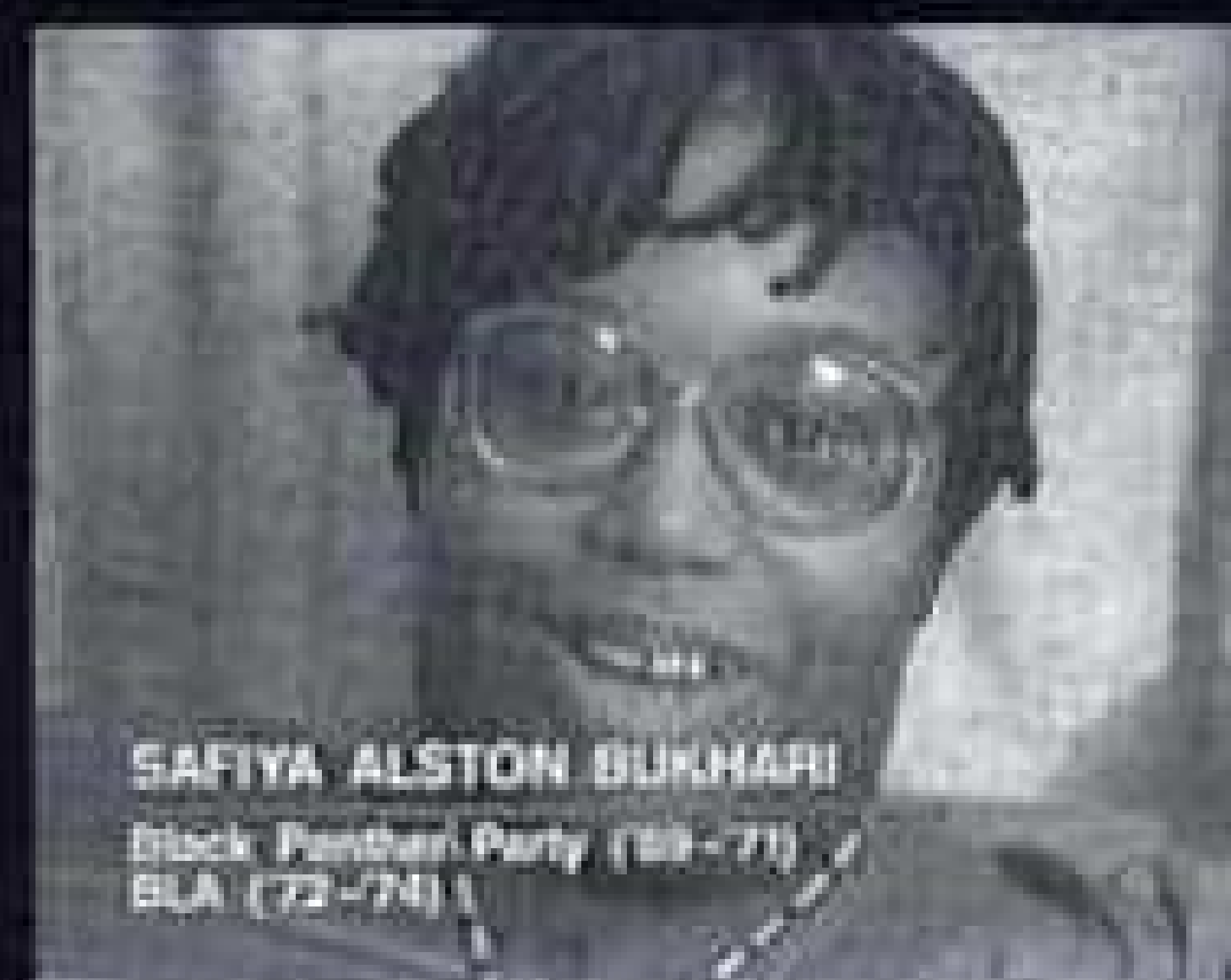
SAFIYA ALSTON BUKHARI Black Panther Party (69-71) BIA (72-74)