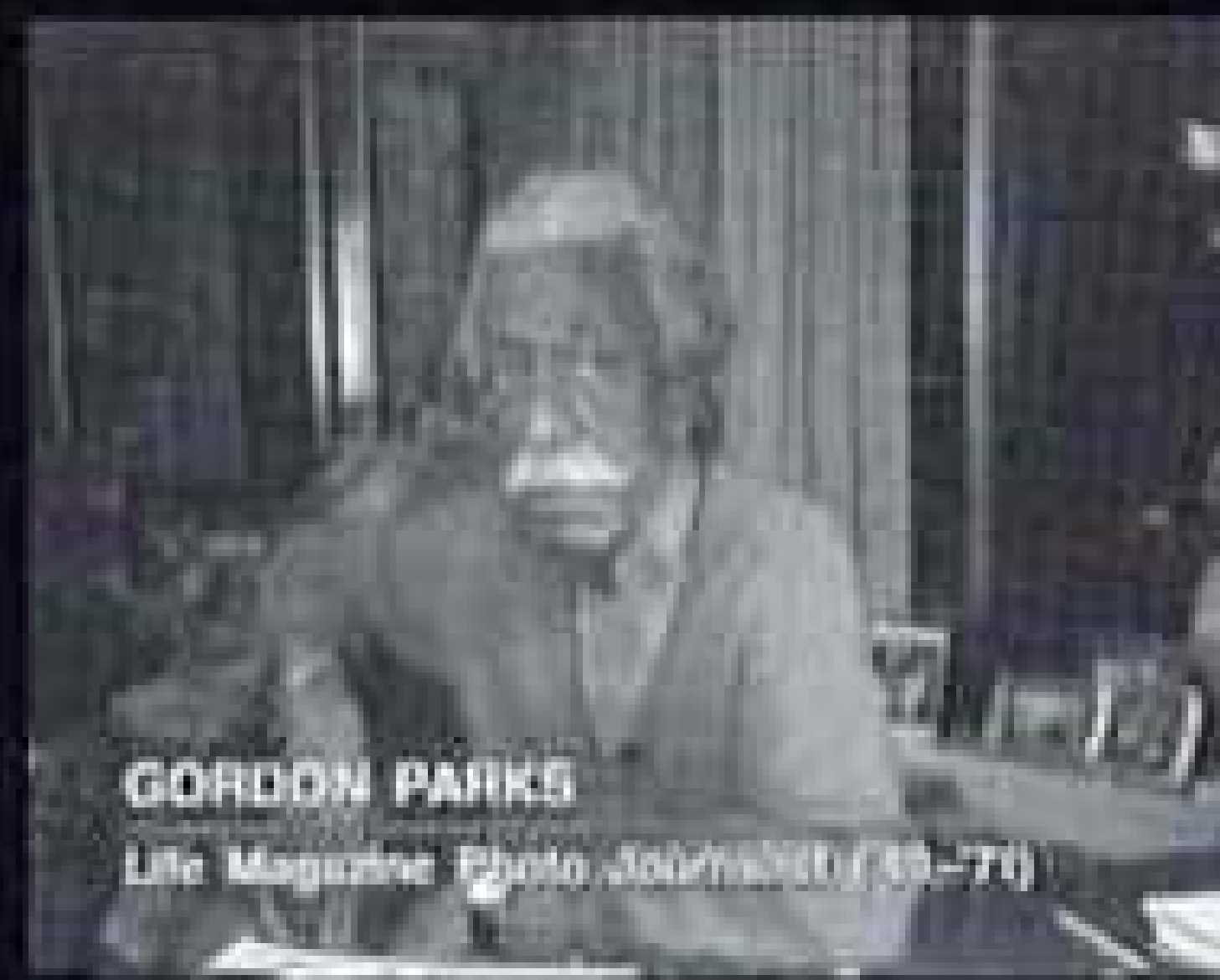
GORDON PARKS Life Magazine Photo Journalist (69-70)