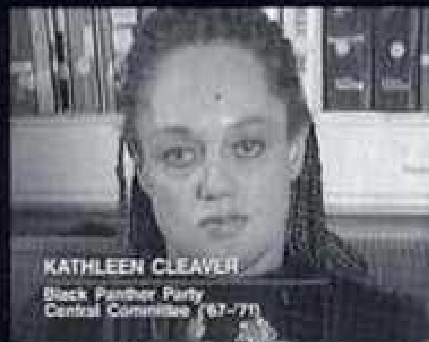
KATHLEEN CLEAVER Black Panther Party Central Committee (67-71)