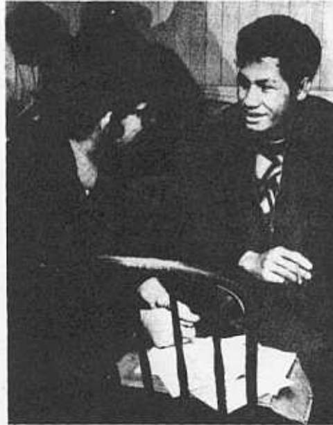
Free educational aid and tutoring are one of the free programs operated by the Polynesian Panther Party. Here a teacher and student go over a homework assignment.

ceived recently by THE BLACK PANTHER. Readers will notice that the P.P.P. has arranged its Platform and Program so that the first letters in each paragraph spell out the word P-A-N-T-H-E-R.