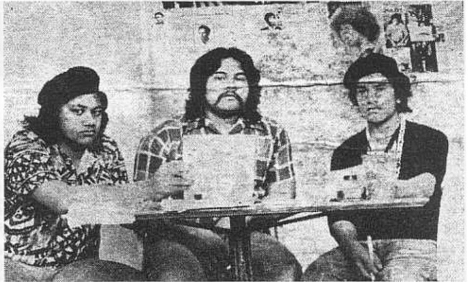
Polynesian Panthers Ponsonby Auckland 1970

In January 1974 the PPP participated in a meeting "amongst all Maori and Polynesian progressive organisations to form a united front".