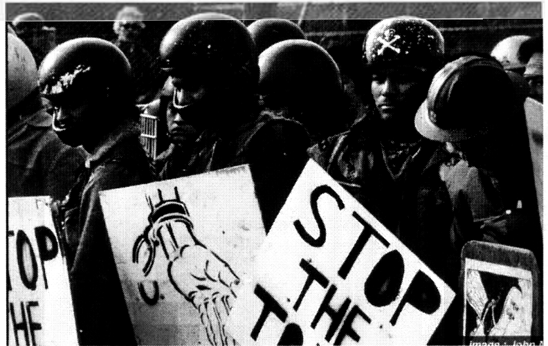
Patu squad from the 1981 Springbok tour

The PPP was active until the late '70s and never officially disbanded. Several cadres were arrested at Bastion Point in 1978 and some even played a role in the "Patu" squad during the 1981 Springbok Tour.