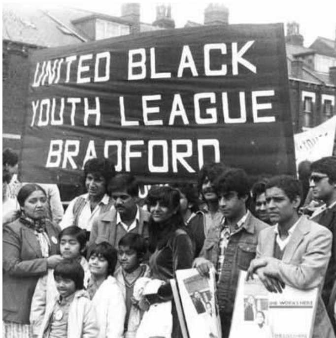
United Black Youth League