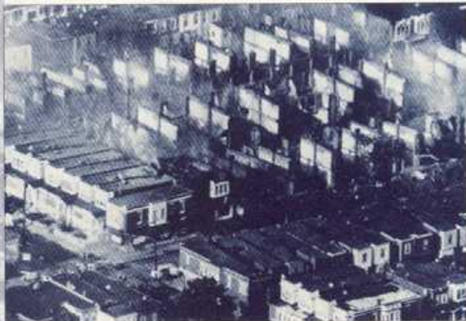
The confrontation turned two city blocks into an "urban battlefield."

The gunfight, accompanied by the police use of tear gas