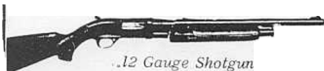
.12 Gauge Shotgun