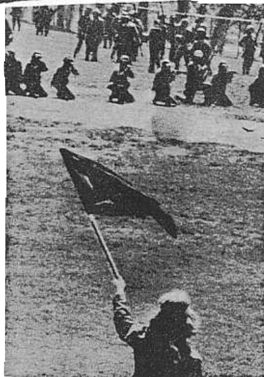
STUDENT WAVING BLACK FLAG AT OHIO GUARDSMEN