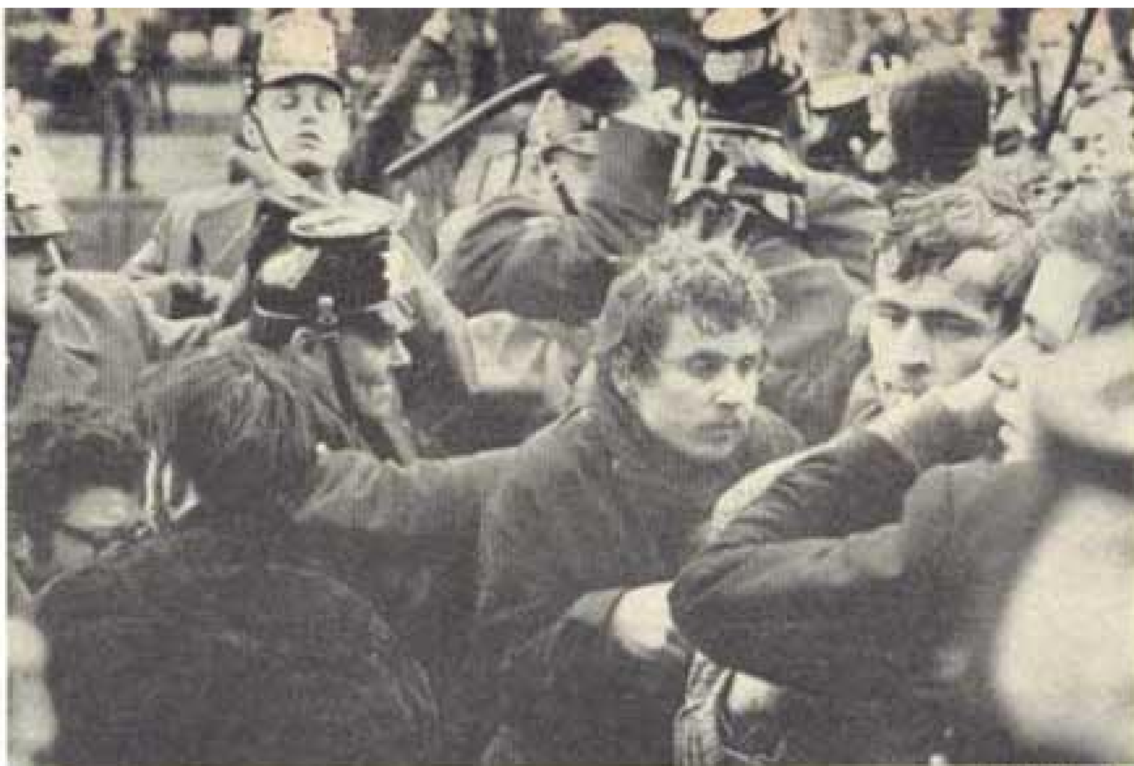
Protesting against mega-packages: Students in West Berlin battle police

The Columbia revolt last week clearly raised the ante of student protest in the United States. It moved the stage of action from seizure of property to seizure of people; it demonstrated that a few hundred organized students can shut down almost any school in the country. And each time the potential for destruction grows higher