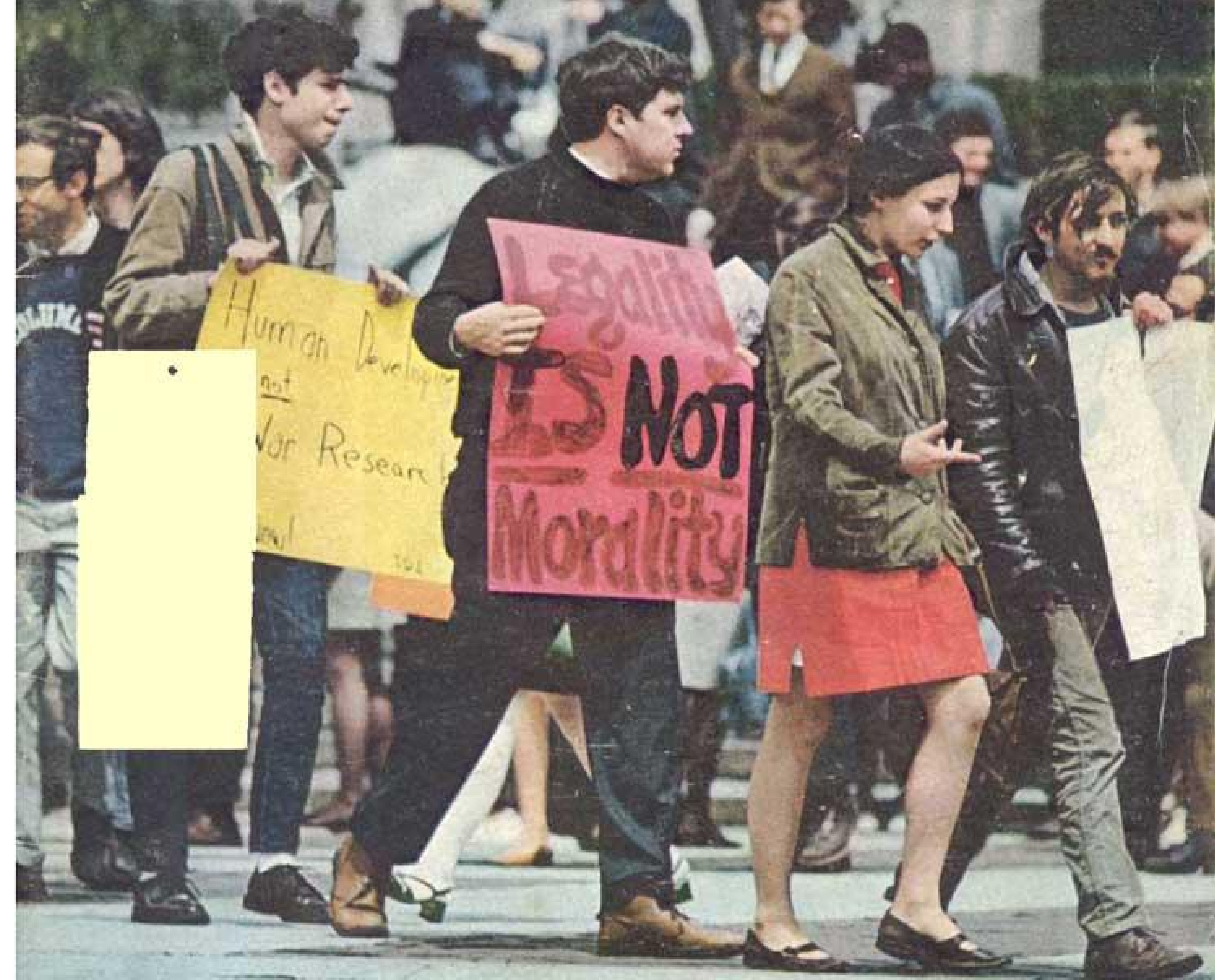
Demonstrators at Columbia