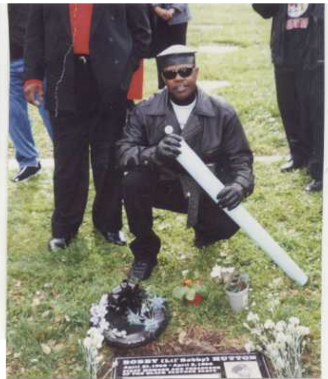
BOBBY (Lil' Bobby) HUTTON Grave Site